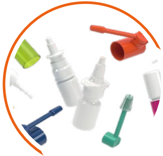
Nasal pumps (Advancia ® , bioequivalence, SP range)

From commercial references to concept devices, Nemera offers various solutions for ENT delivery: