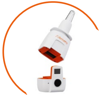
Concept electronic devices

RetroNose™ is a pMDI concept device that targets nasal drug delivery through oral administration.