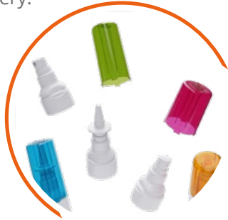
Child Resistance Solutions