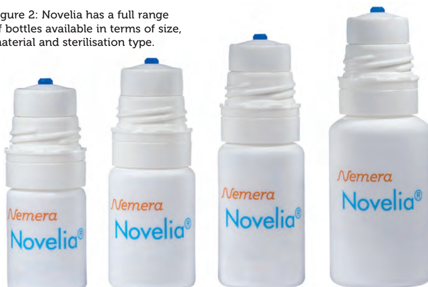
Figure 2: Novelia has a full range of bottles available in terms of size, material and sterilisation type.

"Effective drug delivery and patient adherence to treatments are increasingly important considerations in ophthalmology."