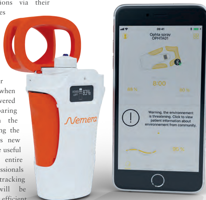
Figure 4: Nemera's e-Novelia ophthalmic add-on won the "Excellence in Pharma: Drug Delivery Devices" Award at CPhI Worldwide 2018.

By conducting interviews in a natural home setting, familiar to the patient, Nemera is able to obtain a more accurate insight into how drug delivery devices are actually used. There is significant value to be derived from this method of understanding, characterising and prioritising user needs, which is best initially achieved through applied ethnography. This method relies on a combination of interviews and in-context observations of practices, processes and experiences within the patient's home, clinical environment or any natural setting. This approach can yield a deep, longitudinal understanding of the patient journey – from diagnosis, to treatment selection, to onboarding and ongoing use.